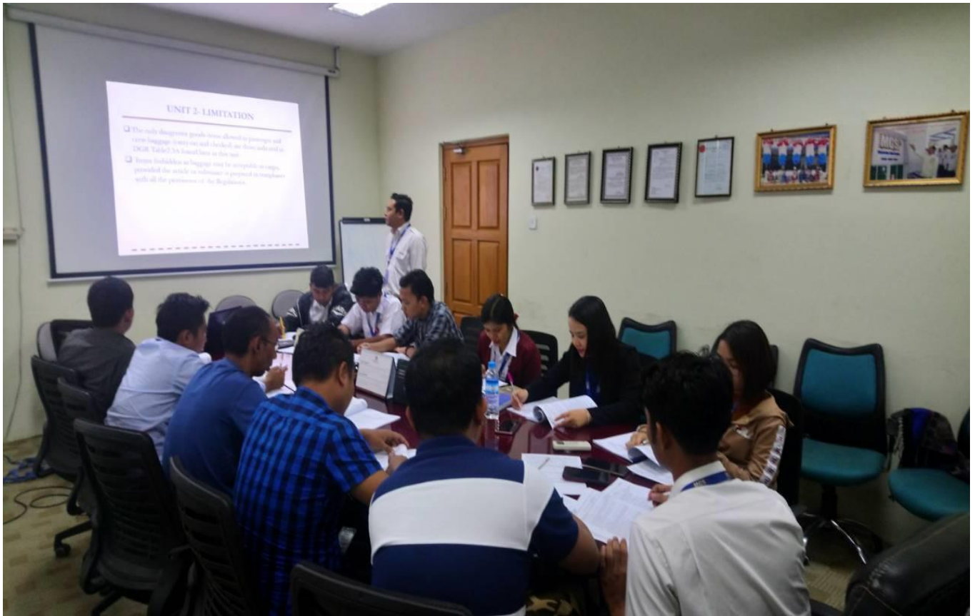
Dangerous Goods Regulation Training Cat 8(Recurrent)