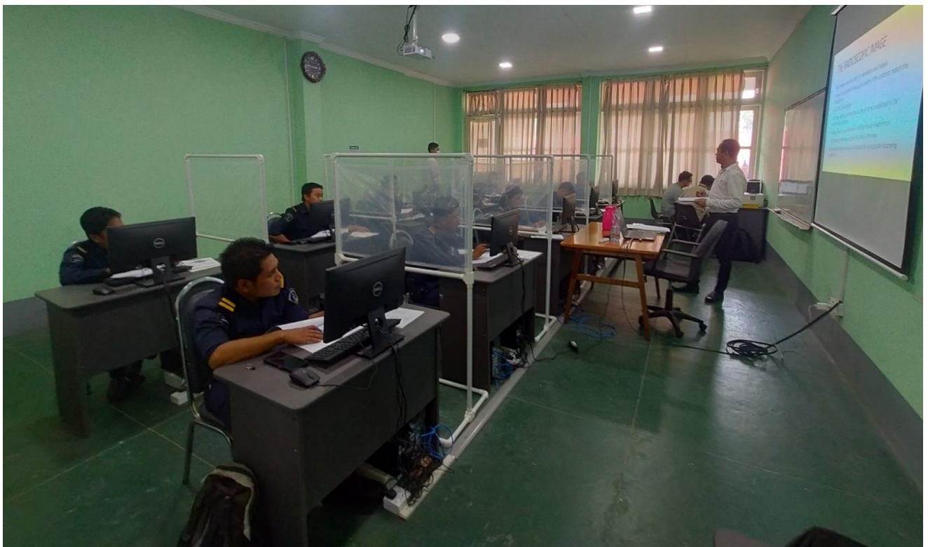
X-Ray Operator CBT course