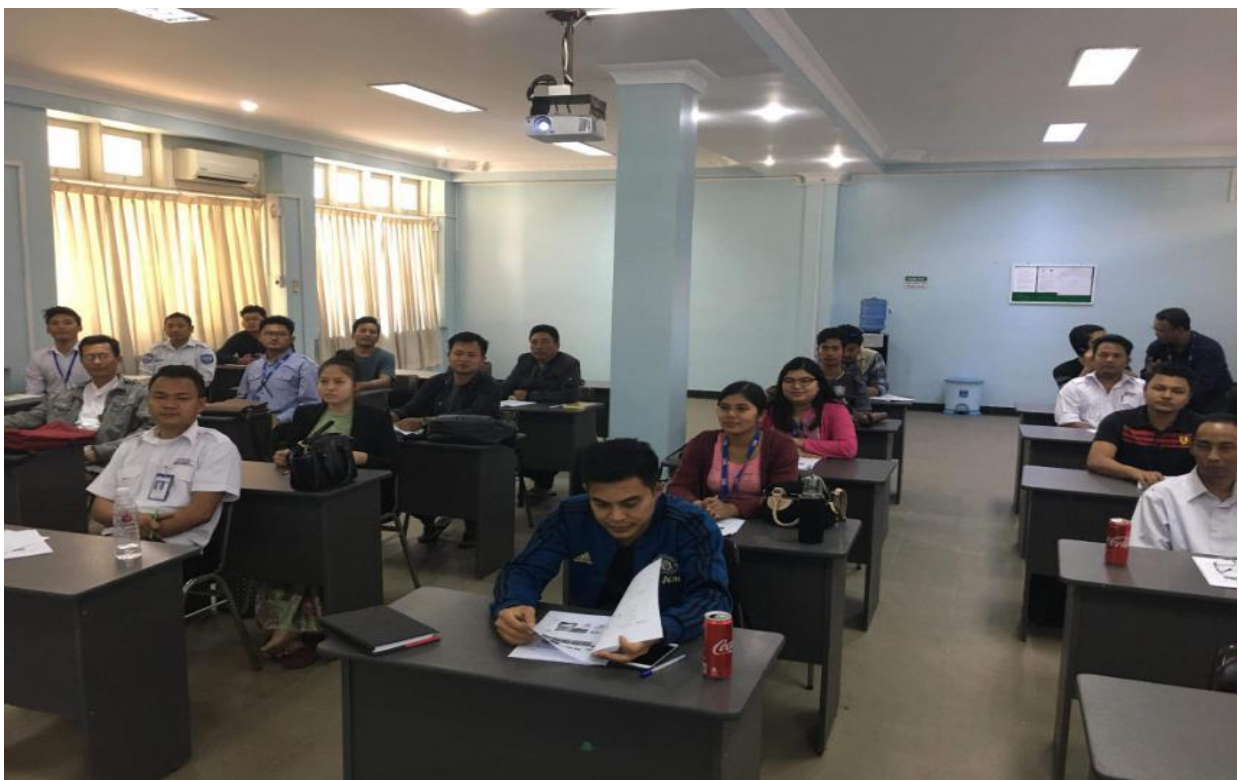
Cargo Warehouse Operation Training