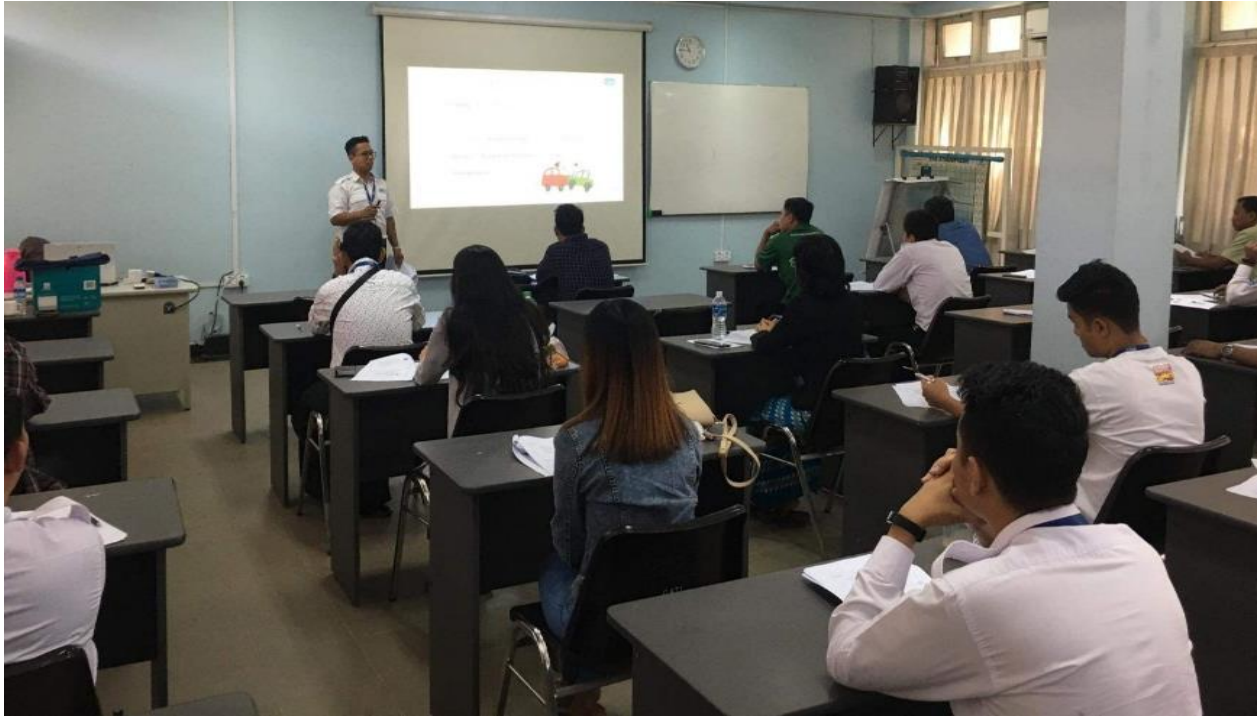
Warehouse Safety Training

Under new program, let workers to know about knowledge, information and worker rights by supporting respective books and annual seminar on warehousing, health care, work-place security and others.