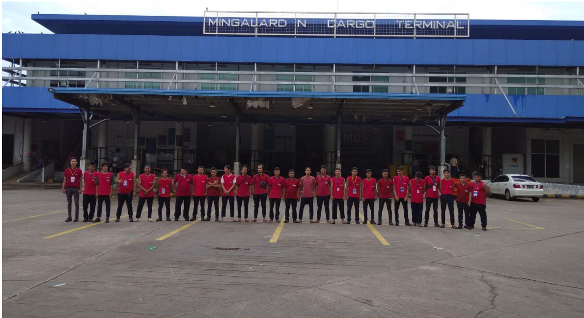
MCS staff Cleaning Day on every Sunday for Environment